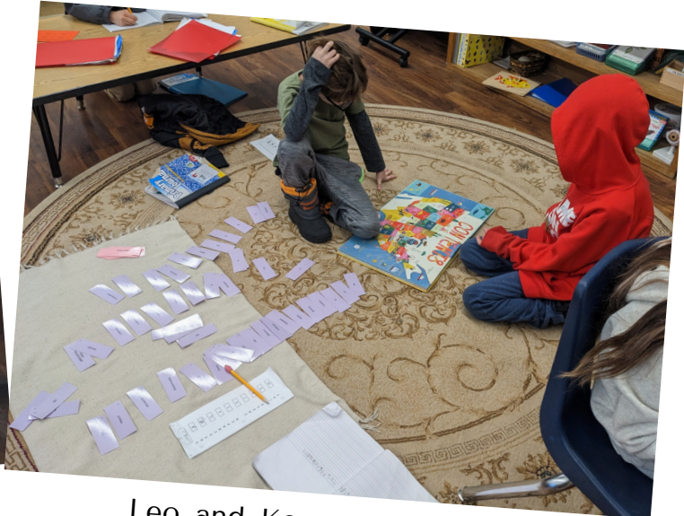
Leo and Konner use a map to learn more about abbreviations and postal codes