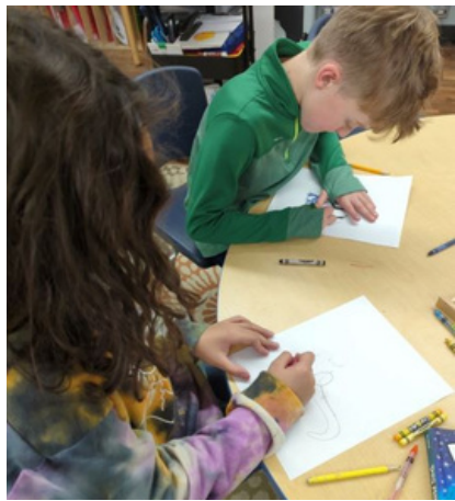
Abel and Royce work on their Mystical creature/animal stories for the class book