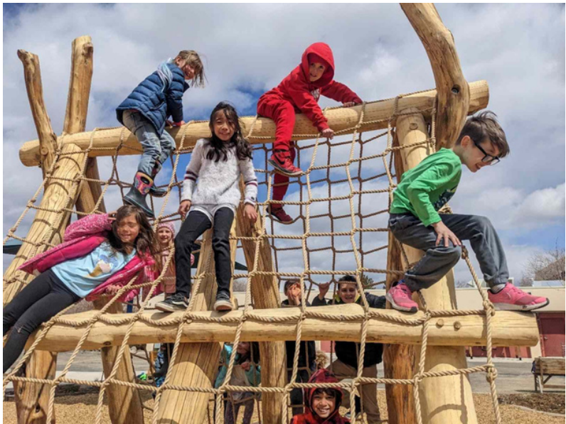
Virginia class loves the new playground!

Our math is moving forward really well! Multiples seem to be the fad with trinomial work for others being the most exciting. Kindergarteners have begun visiting and will be meeting soon as a team to determine our end of the year plans.