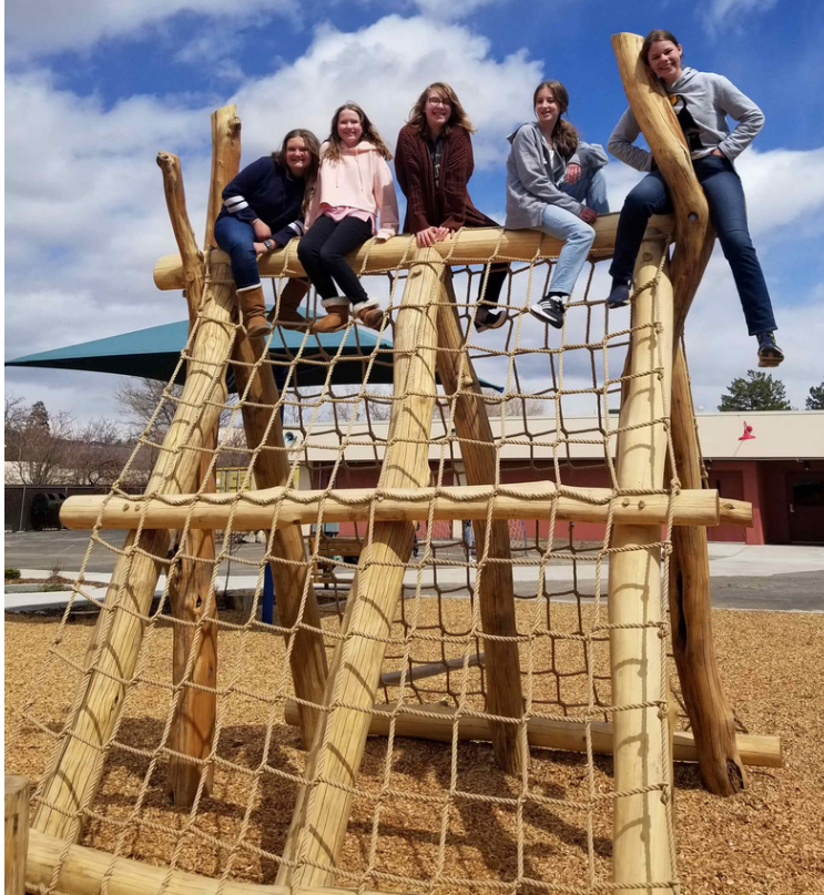
Adolescent students enjoying the new playground!