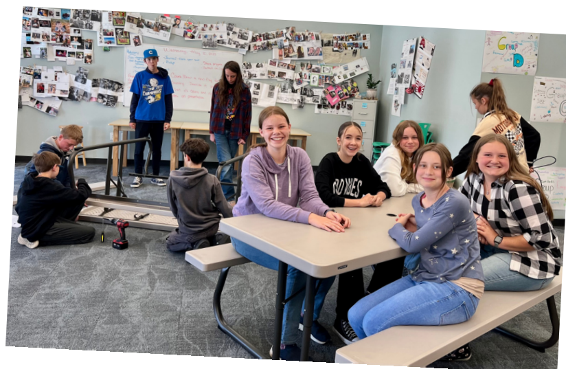
School Community Projects- students assemble tables for our rooftop community space.