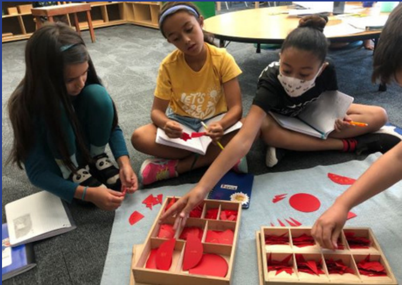
Students comparing fractions