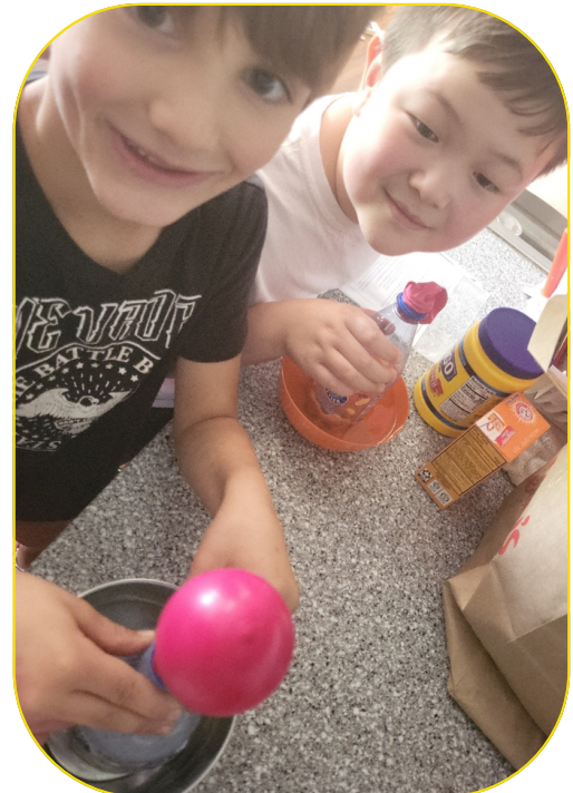
Sheppard and Ellison explore the laws of the universe following up on the story of the Coming of the Universe, the first great lesson.